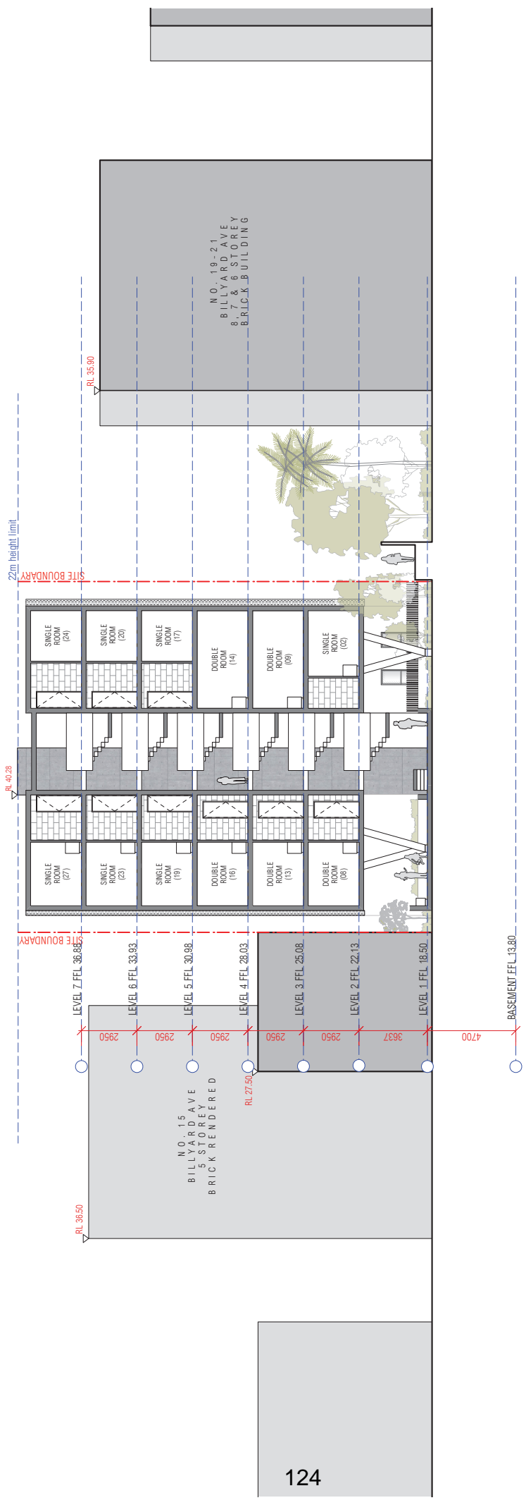
01 SECTION BB - PROPOSED 1:200 @ A3